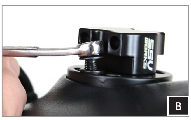
B. Loosely install the clamp base to the US-C68 with (2) M6x1.0x20mm screws and washers using a 8mm open-ended wrench. Position the clamp base to your desired position and tighten the (2) M6x1.0x20mm screws.