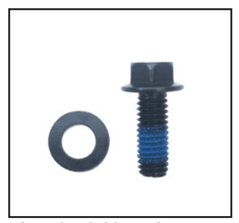
4. M6x1.0x20mm (8mm Hex Head) Screws & Washers x4