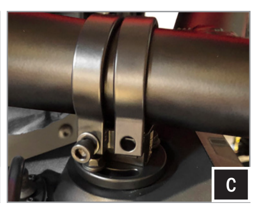
C. Wrap a plastic bag around the roll cage to prevent scratching. Press the clamps onto the roll cage over the plastic bag. Place the (2) M6x1.0x45mm screws and washers through the clamp and clamp base. Secure the clamps to the roll cage with a 5mm allen key.