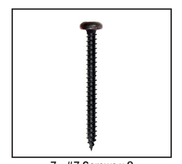
7. #7 Screws x 8 (comes with unloaded pods only)