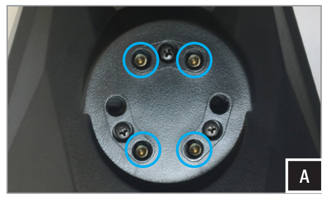
A. Find your desired orientation for the US-C8 on your roll cage and fasten the set screws with a 3mm allen key in the opposite holes of where the clamp will install.