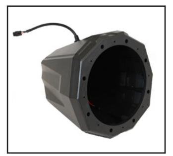
1. US2-C8 Enclosures (1 pair)