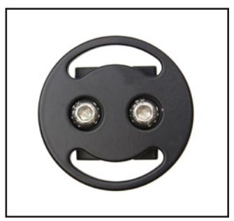
2. Dual Mounting Ring Adapter x 2