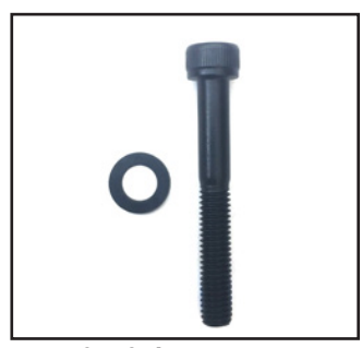
5. M6x1.0x45mm (5mm Allen Head) Screws & Washers x4