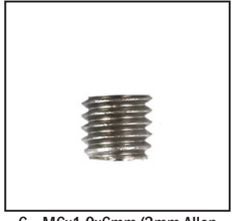
6. M6x1.0x6mm (3mm Allen Head) Screws x4