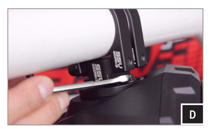
D. Position the speaker to your liking and tighten the M6x1.0x20mm screws.