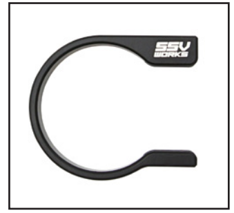
3. Ring Clamp x 4