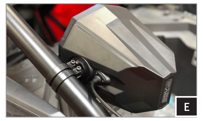
E. Route the speaker wire away from any moving parts and any sharp metal, then connect to the amplifier.

Connecting the US2-C8 using the pre-installed will require an optional SSV Works plug-&-play harness (B-H2195 - sold separately). If you are not using the B-H2195 harness, simply cut off the two-pin connector and follow the wiring instruction below.